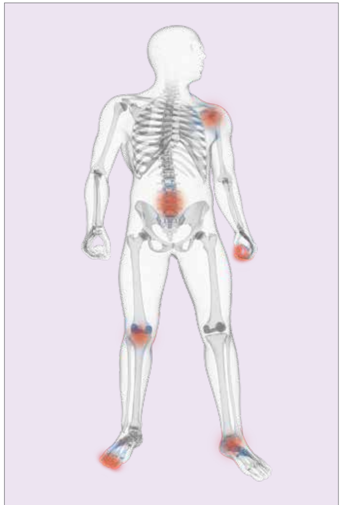
Figure. Joints affected in psoriatic arthritis